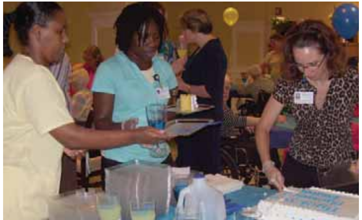
Hospice & Palliative Care Charlotte Region honors the staff of Plantation Estates Retirement Community. We hosted a party in celebration of our collaboration to improve care for their residents with life-threatening and terminal illness.