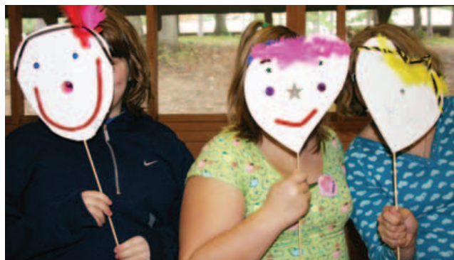
Campers have fun and learn skills to cope with their grief. The activity pictured above helps children express their feelings, both happy and sad, on two-sided masks.